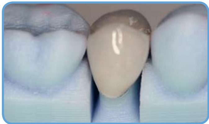
Fig 3 SLA Model

For purposes of comparison, two Lava zirconia crowns were fabricated: one derived from the digital impression and one derived from the traditional impression.