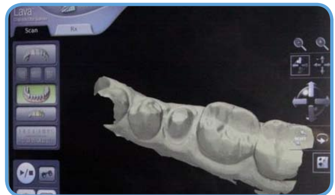
Fig 2 Display