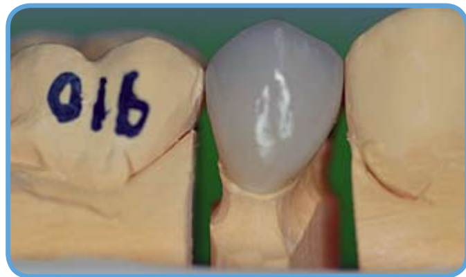
Fig 4 Traditional Model

Each crown was carefully checked on its respective die, then on the opposite die, and on the actual tooth. The crowns were evaluated for fit, stability, esthetics, occlusion, and the quality of the mesial, distal, lingual, and facial margins. The crown with the best fit and accuracy was cemented intraorally.